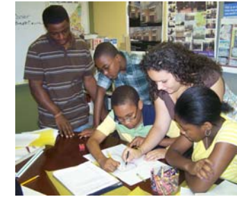
Urban Planning Student Interns begin their design.

This summer, CTA's Transforming Distressed Communities (IDC) program engaged middle and high school student interns from the City of Orange Township and the City of East Orange Public Schools in an intensive 8-week process to transform a former Brownfield site into a usable space.