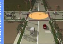
Alden and High Street Perspective for New Traffic Calming Devices

The implementation of pedestrian hierarchy for the project site was a primary goal in order to allow pedestrians to have access to the project site. To achieve their goal, traffic calming devices were included at major intersections with traffic lights and stop signs highlighted by pedestrian crosswalks.