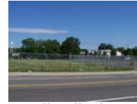
Project Site– ‘Cleared to Residential Standards’