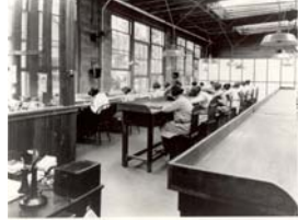
Interior of U.S. Radium Corporation