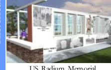
US Radium Memorial

The US Radium Memorial replicates the hazardous working environment of the workers due to their handling of the radium to create glow-in-the-dark watches for soldiers in World War I. The memorial design also includes the historical timeline from 1917 to 2005 of significant events commemorating the past and present.